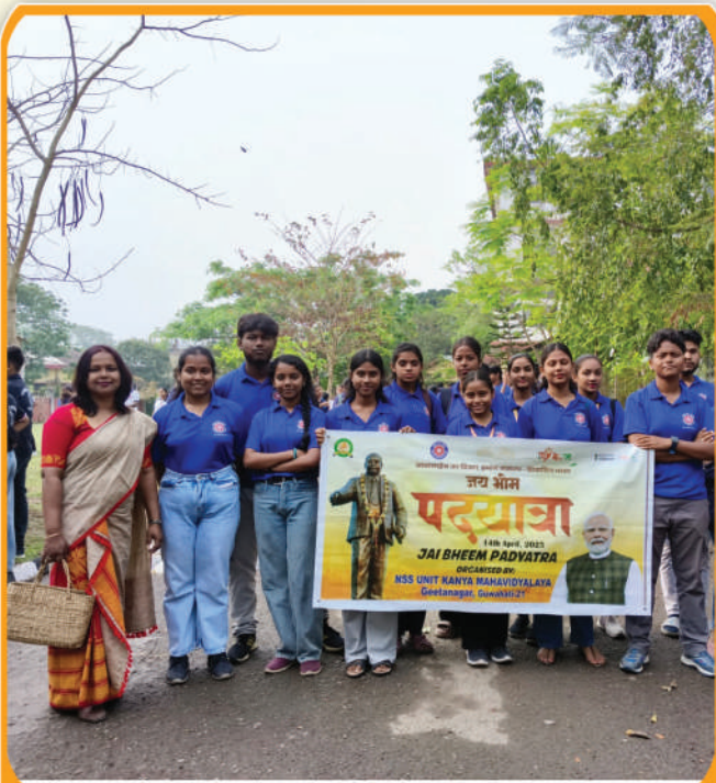
Jai Bhim Padayatra by NSS