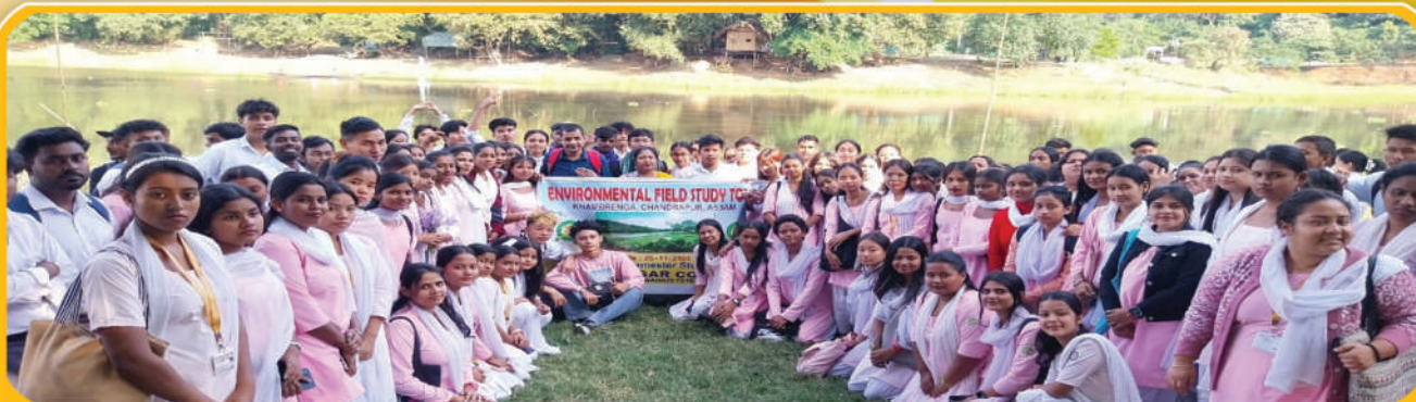
Environmental Field Study