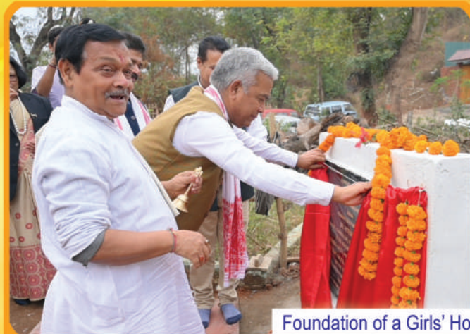
Foundation of a Girls' Hostel & a New College Building