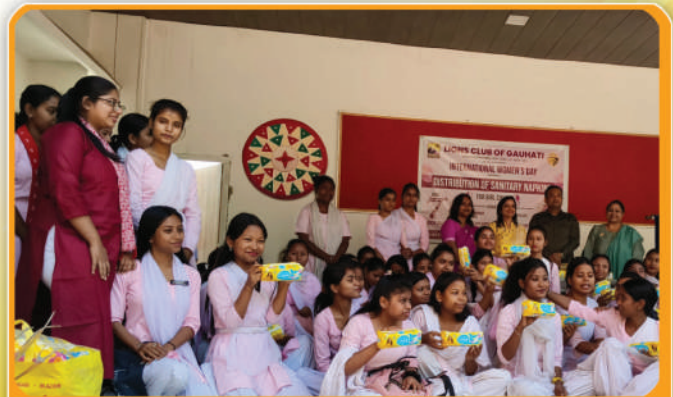
International Women Day Celebration