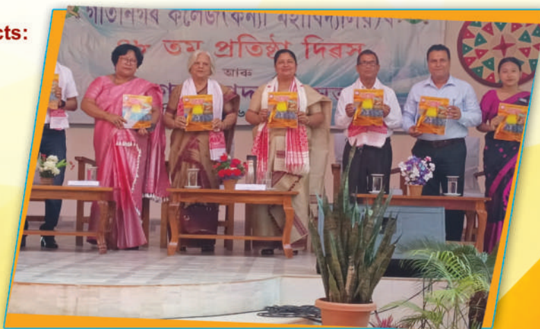
College Foundation Day