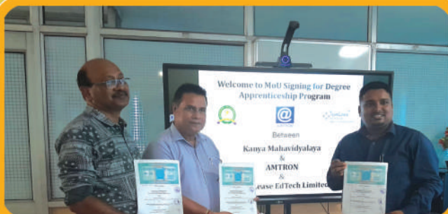
MoU with AMTRON